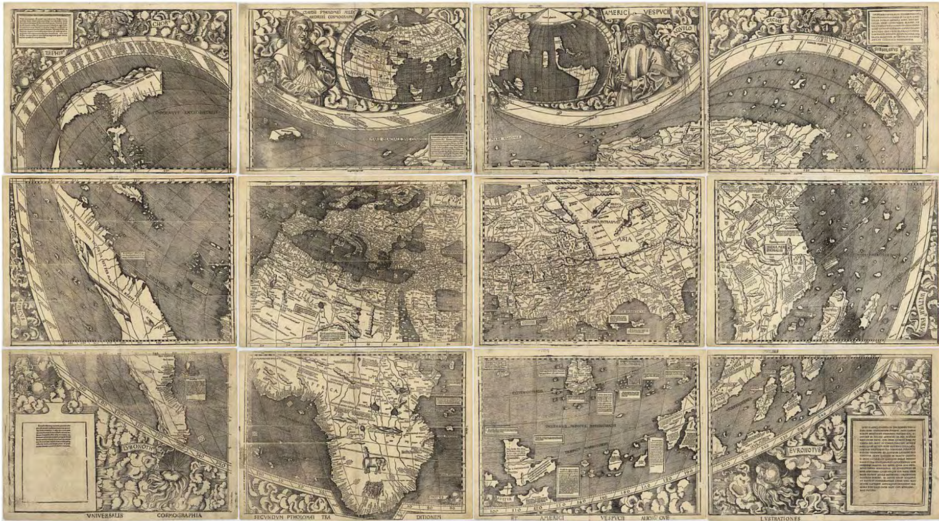
Universalis Cosmographia, 1507. Matthias Ringmann and Martin Waldseemüller.